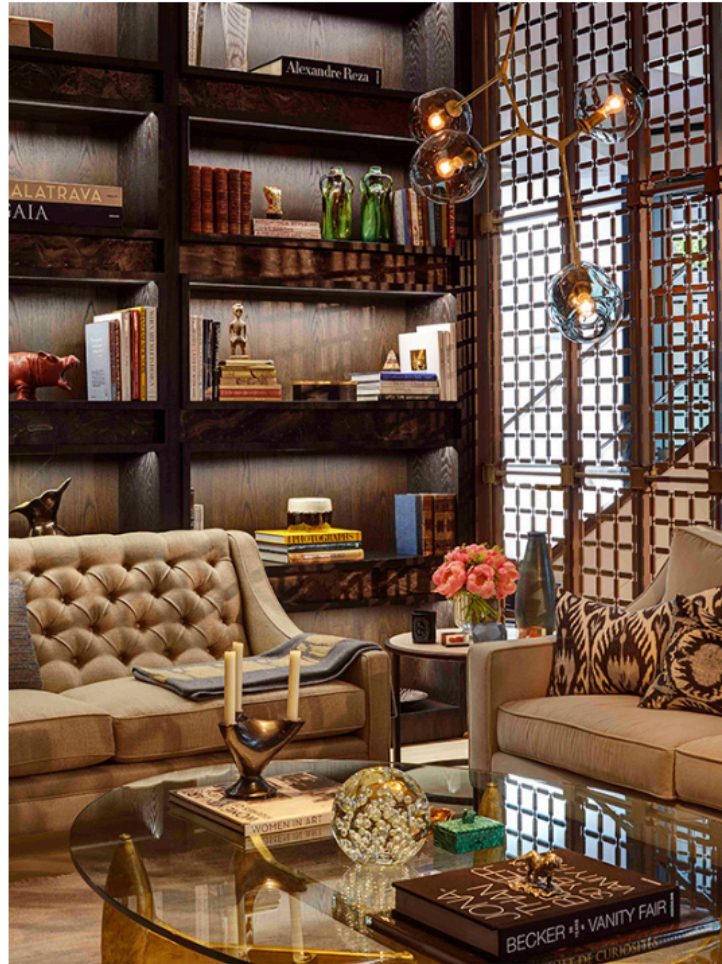
Inside the show apartment at No 1 Palace Street in London, next to Buckingham Palace

Asked if he had a favourite spot and Rodriguez says, “The amazing reception area overlooking the Buckingham Palace Gardens, with all its original features reinstated”. And while future residents will have to wait until December 2020 to move in, they can, for now, ruminate about what life will be like living next to the British royal family.